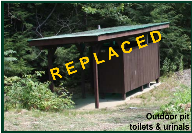
Outdoor pit toilets & urinals

George W. Magee Memorial Trust fund has made it possible for many Massachusetts BSA Council camps throughout New England to improve their facilities and bring them indoors while still preserving the natural environments of the camps. The Clivus composting systems installed at these and other camps use no water, discharge no polluting waste, and help replenish natural resources. Scouts also get a lesson in preservation!