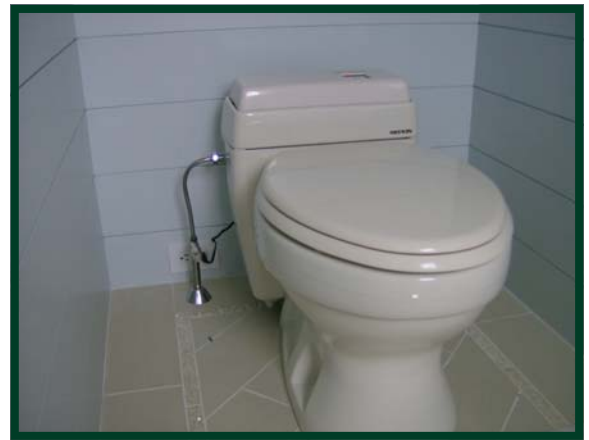
Clivus composting systems reduce solid waste by 95%; 3-ounce foam-flush toilets use 97% less water than conventional toilets.

The building was designed to utilize the topography of the site. By building into the hillside it was possible to reduce excavation and place the basement at "ground" level for easy access. Also, overall site disturbance was minimized by a much smaller sized soil absorption system for greywater only.